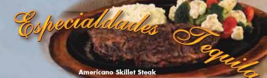
Americano Skillet Steak