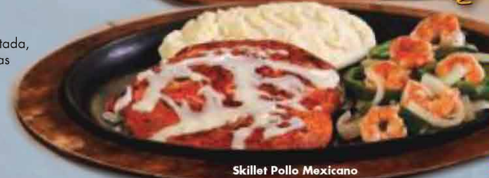
Skillet Pollo Mexicano