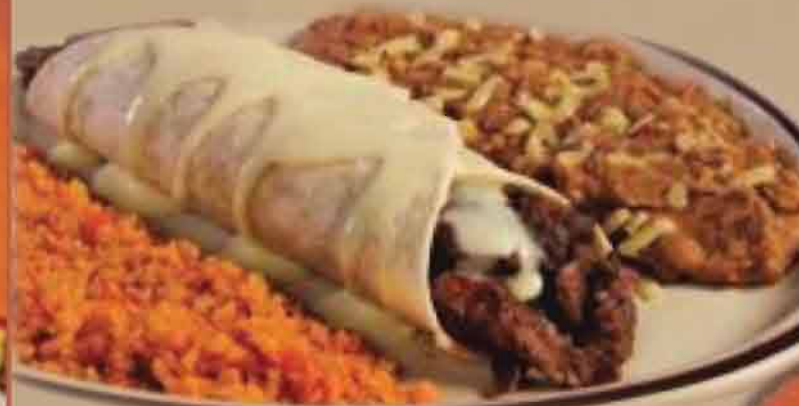
Burrito Al Carbon

BURRITO SUIZO A flour tortilla filled with grilled steak, beans, lettuce and tomato then topped with burrito and cheese sauce 7.99